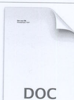
Ger van Elk.doc